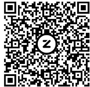
Figure 1: Zapper QR code for donations to Verity Park Childrens playground

The children's play area within Verity Park is in a generally good condition. PRABOA attends to periodic sewage overflows into the play area (caused by the defunct adjacent ablutions) and deploys the Bubele Africa clean-up crew to perform a basic general clean-up on a quarterly basis. The fencing around the Children's play area has become an increasing concern, with holes in the fence allowing dogs to gain easy access into the play area and with a makeshift wooden board in one section providing the only barrier between the children and the road. The lovely children's mural is also being overtaken by graffiti. On November 28 th -30 th PRABOA will conduct a clean-up of and repaint the children's play area wall as well as the wall of the adjacent ablutions. The fence around the children's play area will also be replaced in its entirety, providing a secure space for our children to play. This project will be completed by the end of November, in time for the children to enjoy our park and playground by the time the school year finishes.