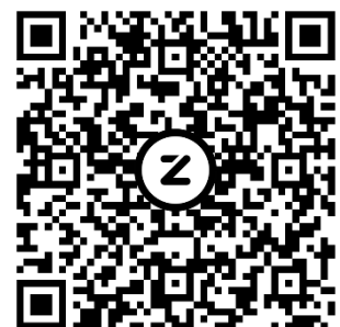
Figure 2: Zapper QR code for donations to Verity Park